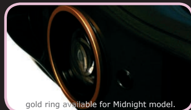
gold ring available for Midnight model.

Each unit is double checked and calibrated by our 20-years experienced video engineer in order to obtain a perfect picture quality and finish. DreamVision also chose the most advanced manufacturing process and luxurious materials such as ABS-PC also used in aeronautic for its extreme rigidity and performance in heat and noise absorption.